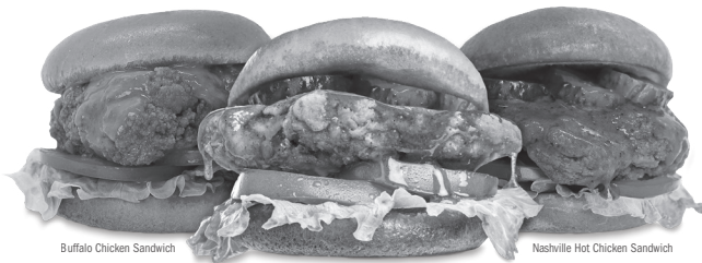
Buffalo Chicken Sandwich