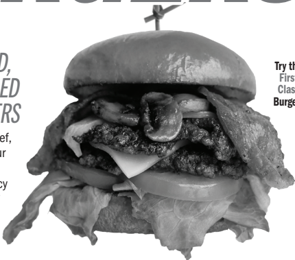
Try the First Class Burger!

Fresh cuts of select beef, hand-pressed onto our flat-top grill for that "old-school" crispy-juicy grilled burger "WOW."