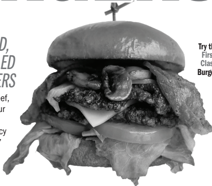
Try the First Class Burger!

Fresh cuts of select beef, hand-pressed onto our flat-top grill for that "old-school" crispy-juicy grilled burger "WOW."