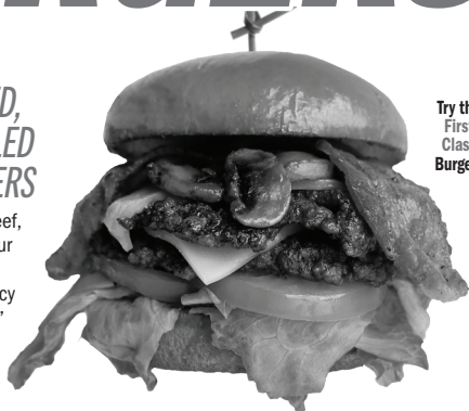
Try the First Class Burger!

Fresh cuts of select beef, hand-pressed onto our flat-top grill for that "old-school" crispy-juicy grilled burger "WOW."